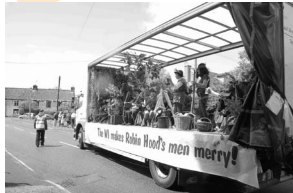
Wi's Robin Hood float took the prize