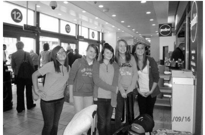
The girls leave Bristol for their London adventure