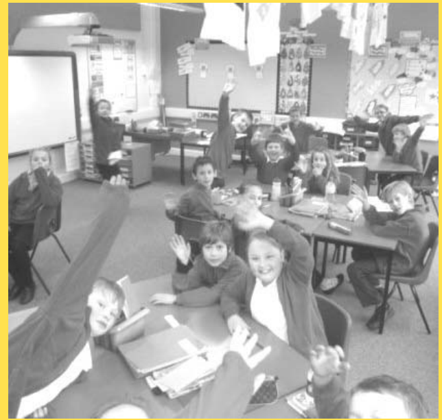
Pupils love their new classroom, which provides a good environment for learning