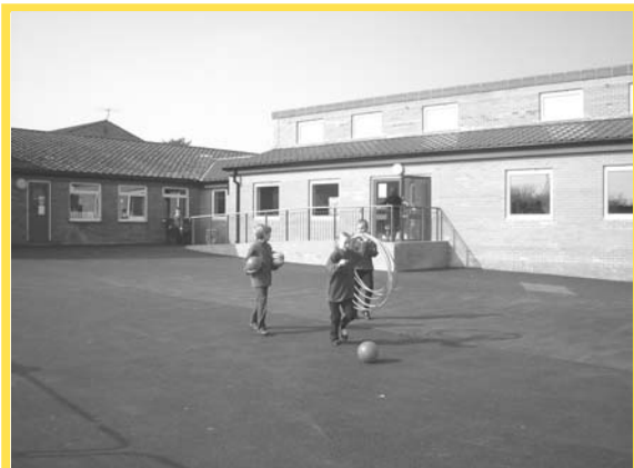
The new building houses two new classrooms and provides all the mod cons